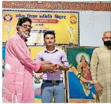
विद्यामन्दिर में छात्रों को सम्मानित करते लोक शिक्षा अधिकारी