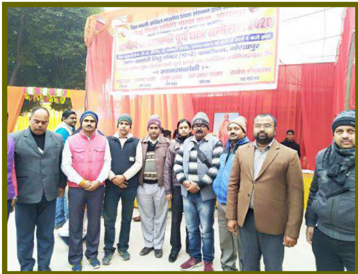
Around 1000 Alumni attended the Alumni Meet.