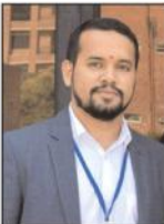
1977 ई. में हुई और वर्तमान में

बोली। सरस्वती विद्या मन्दिर का नाम युवाओं हो हमारे मन-मस्तिष्क में सर्वस्वमयी, पुण्यताराण और संस्कारित शिक्षा प्रदान करने वाले विद्यालय को परिकल्पना देवोपमान होती है। इसी-व्यवहारी के परीक्षा परिणामों में राष्ट्रीय बोर्डों में विद्याभारती में सर्वोत्तम विद्यार्थियों के छात्र-छात्राओं द्वारा अपना परचम लहराते देखकर इसके सकारात्मक राष्ट्रीय प्रभाव को देखा जा सकता है।