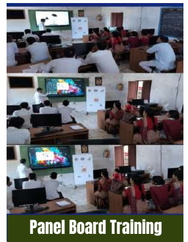
Panel Board Training