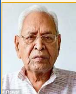
Late. Shri Dinanath Batra (3 Mar 1930 - 7 Nov 2024)

Disciples Immortalized Their Teachers — Scholarship and Lab Established in Their Names