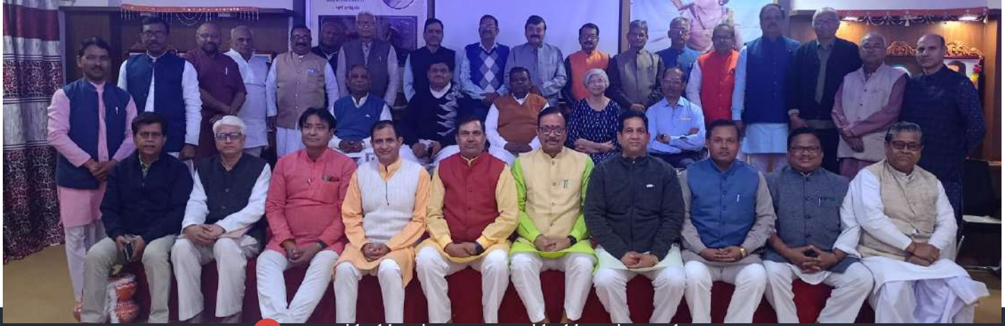
www.vidyabharti.net | www.vidyabharatisamvad.com

A total of 33 attendees participated, including regional heads, state heads, and selected assessors from across the country.