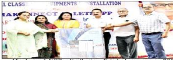
Members of NGOs distributing digital classrooms to BSS schools in Jammu on Friday.