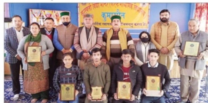
कुमारसैन : सरस्वती विद्या मंदिर में अन्वल विद्यार्थी सामुहिक चित्र में।

कमारसैन, १६ मार्च ( स्रोनी ): सरस्वती विद्या मंदिर विद्यालय हमारसैन में हिमाचल शिक्षा समिति जिला शिमला की योजना बैठक का आयोजन किया गया। बैठक में जिला शिमला के अंतर्गत चलने वाले 52 सरस्वती विद्या मॉदिरों के सत्र 2021-22 के लिए योजना बनाई गई।