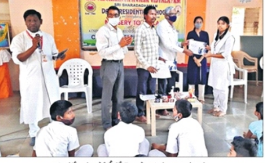
చిత్రలేఖనం పోటీల్లో గెలుపొందిన విద్యార్డులకు ప్రశంస ప్రణాలను అందజేస్తున్న శారదధాం అధ్యాపకులు

డిజైన్, కోలేజ్ వర్క్ లపై పోటీలను నిర్వహించగా తమ పాఠ శాలకు చెందిన 144మంది విద్యార్థులు పాల్గొన్నారని వివ రించారు. అందులో 25మంది బంగారు పతకాలను సాధించగా ముగ్గురు విద్యార్శులు మెరిట్ సాధించినట్లు