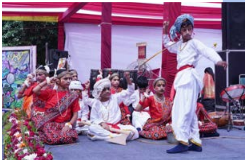
A theatrical presentation based on the life of Bhagwan Birsa Munda