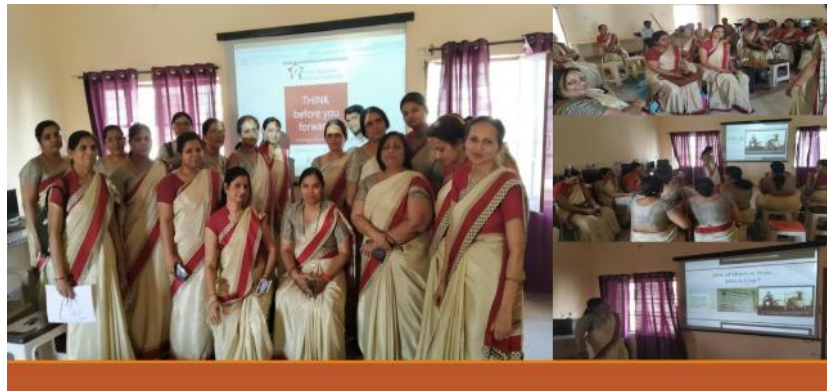
Balika Vidya Mandir Inter College, Kashipur (Uttarakhand)