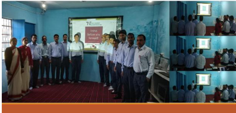
Saraswati Vidya Mandir Chamba (Uttarakhand)