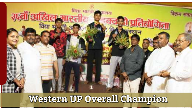
Western UP Overall Champion

Dhanbad: In the 36th Akhil Bharatiya Taekwondo Competition held at SVM, Bhuli, Western UP secured the overall first position, the Bihar region (including Jharkhand) came second, and the North-Eastern region finished third. The competitions were held in Under-14, Under-17, and Under-19 categories for both boys and girls.